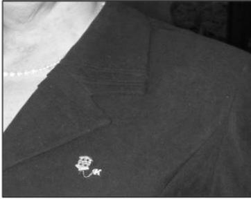
Alpha Delta Kappa Badge