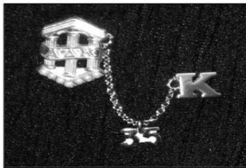
Example: Badge with 35-year charm